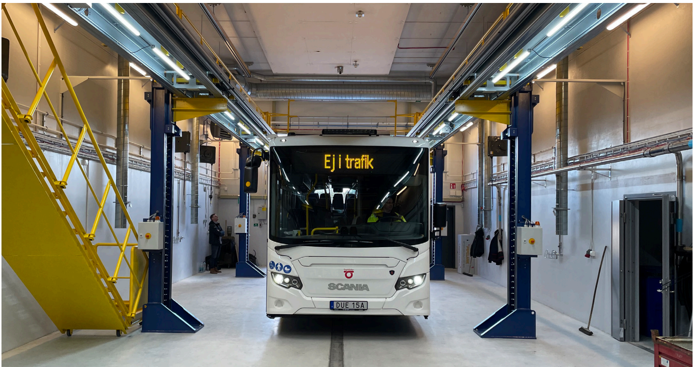
Bus access platforms from Pfaff Verkehrstechnik facilitate maintenance and servicing work on buses

Pfaff Verkehrstechnik is increasingly supplying its recently launched access platforms for bus roof maintenance to municipal bus operators throughout Europe, for example, as far away as Norrköping, a Swedish city in the province of Östergötland.