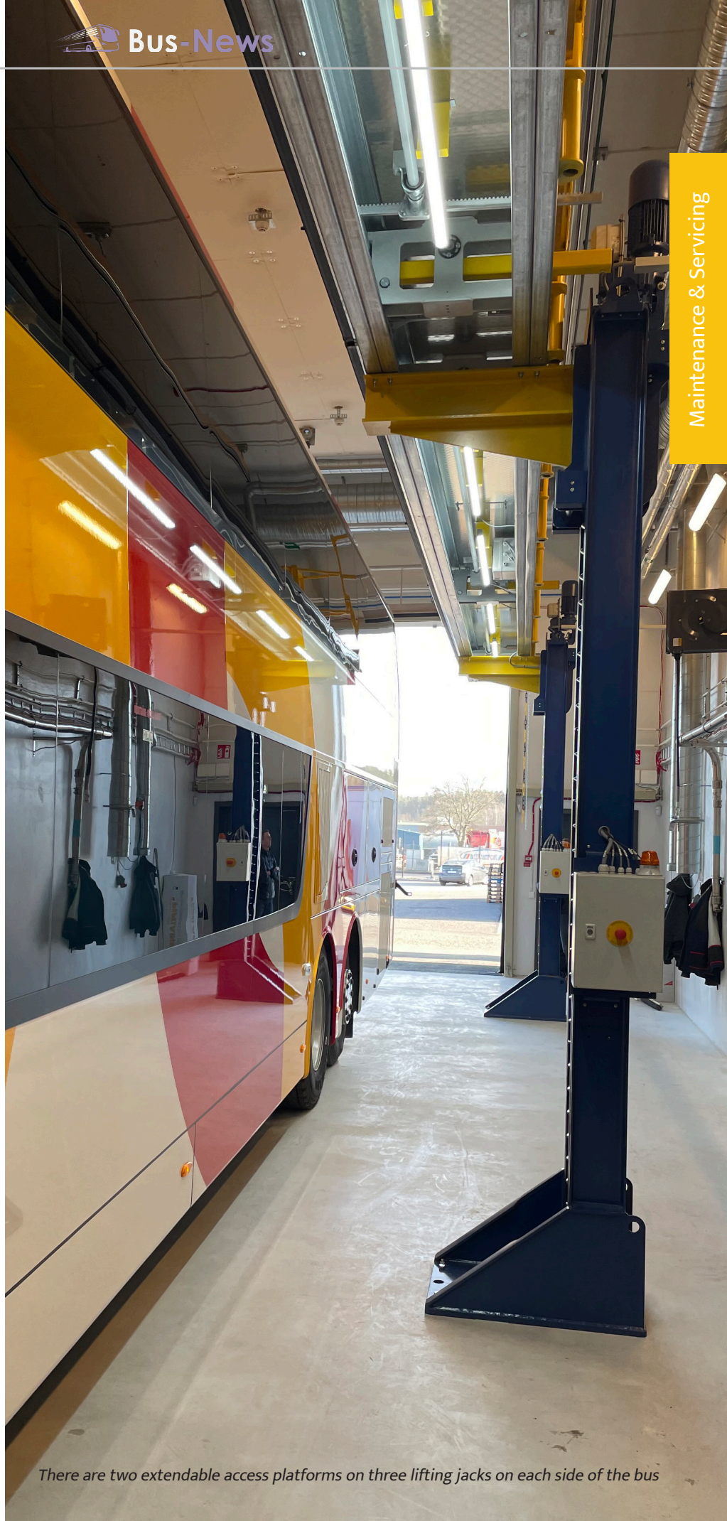
There are two extendable access platforms on three lifting jacks on each side of the bus

Access is via stairs with height-variable steps and a secure access gate at the side of the system. An adjustable railing at the front and rear provides ergonomic all-round fall protection in the complete