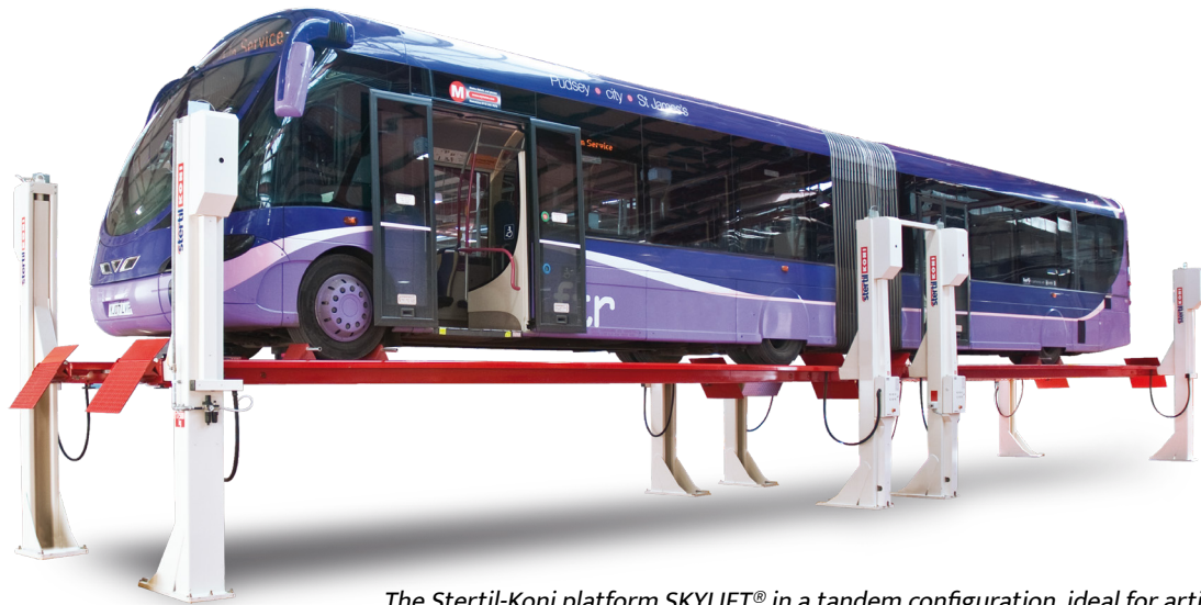
The Stertil-Koni platform SKYLIFT® in a tandem configuration, ideal for articulated buses