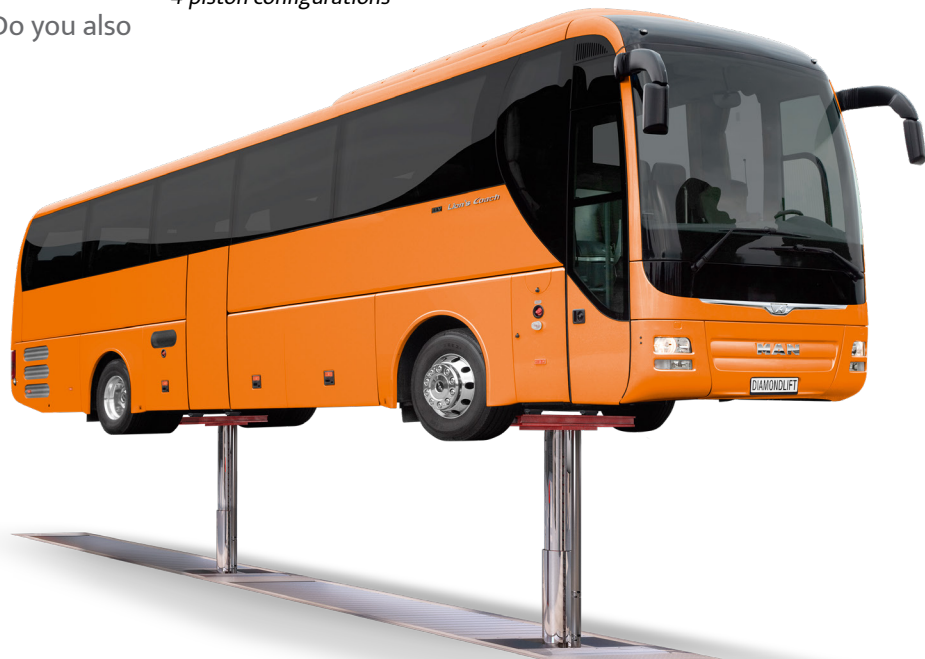
Powerful premium piston in-ground lift, the Stertil-Koni DIAMONDLIFT®, available in 2, 3 and 4-piston configurations