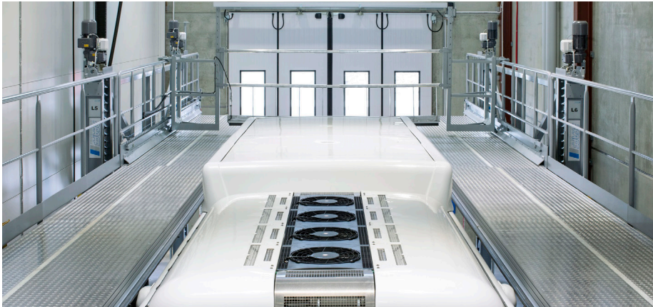
Pfaff Verkehrstechnik expands its product portfolio with solutions for servicing and maintenance work on buses, especially electric buses

In contrast to conventional buses, which run on diesel and require hardly any work on the roof, electric buses require more maintenance work on the roof, since the electrical system and heavy technical components such as battery packs, along with fuse boxes, inverters and air conditioning systems are located there for the sake of convenience. These components require regular maintenance. The curves on the plastic roof, however, present special hazards and challenges for personnel. The new roof working platforms from Pfaff Verkehrstechnik ensure the highest levels of safety and ergonomics for all bus variants – employees feel as safe on them as they do on the ground.