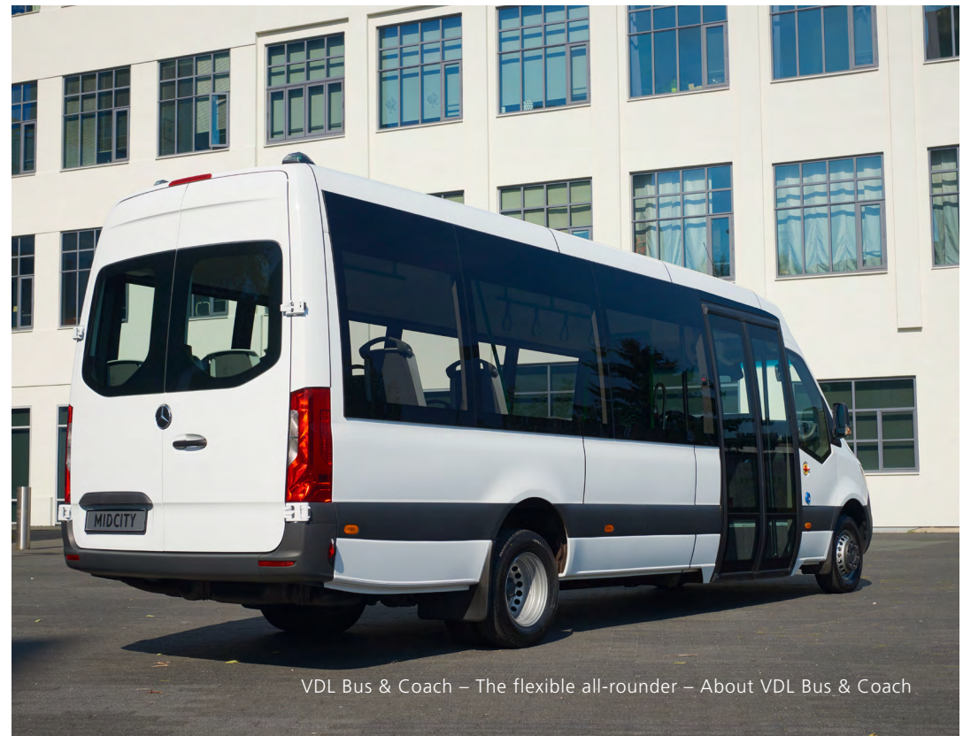
VDL Bus & Coach – The flexible all-rounder – About VDL Bus & Coach