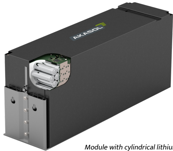
Module with cylindrical lithiumion cells