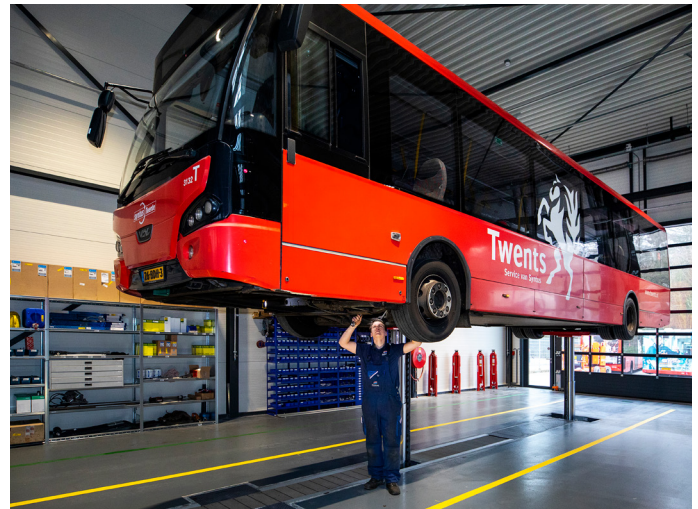
Technicians have direct, safe, ergonomic access to service bus fleets

The DIAMONDLIFT and ECOLIFT are supplied with a free-standing, above-ground control console.