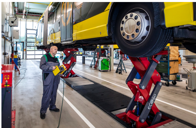
Stertil-Koni in-ground lifts are designed to accommodate vehicles with extremely low ground clearances, such as city transit and articulated buses

The Stertil-Koni DIAMONDLIFT is a telescopic piston lift, and the Stertil-Koni ECOLIFT is a scissor lift.