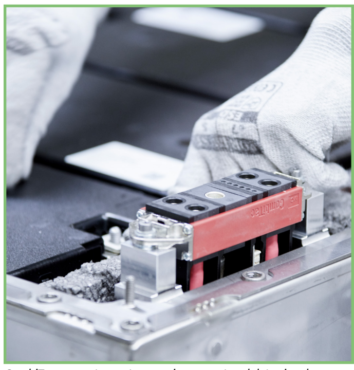
CombiTac connector system carries current and data signals

Stäubli worked jointly with the battery technology leader's engineers to configure a solution based on the modular Stäubli CombiTac system, flexible enough to support a 30% increase in the battery design's performance even without any design modifications. Stäubli also implemented the connection with