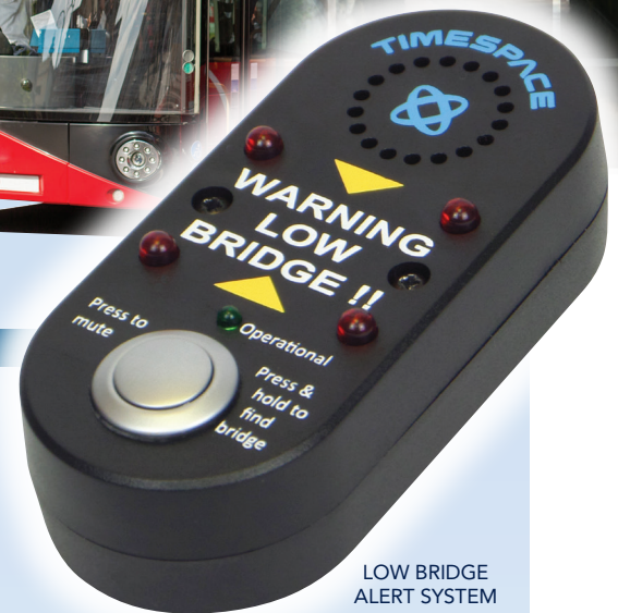
LOW BRIDGE ALERT SYSTEM